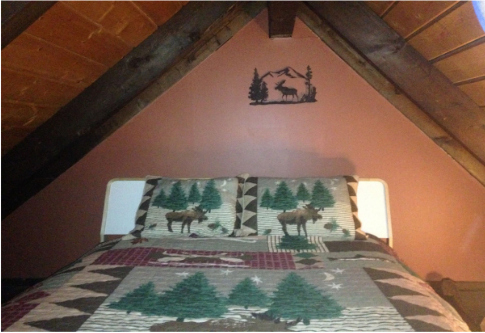
4 Bedrooms, Sleeps 13